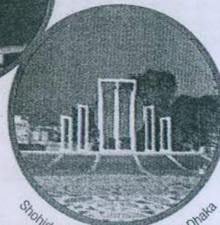
Shohid Minar, Dhaka University, Dhaka