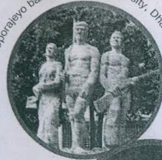
Oporajeyo Bangla, Dhaka University, Dhaka

A series of tour program covers different tourist attractions and engineering installations located in and around Dhaka City. Pre-registration to the Annual Convention is a pre-requisite for attending these field trips.