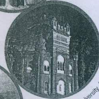
Karjon hall, Dhaka University, Dhaka